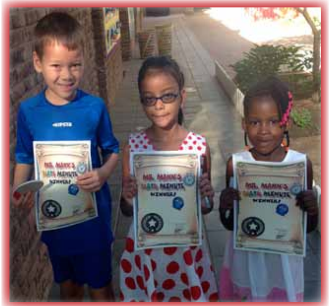
Last week's WINNERS!